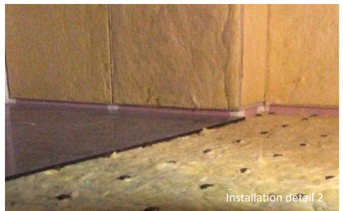
Installation detail 2