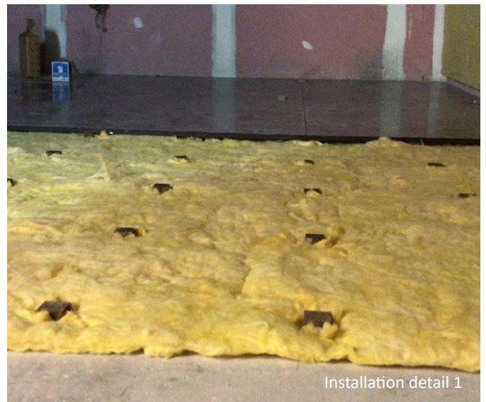
Installation detail 1