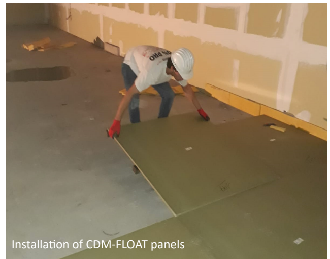
Installation of CDM-FLOAT panels