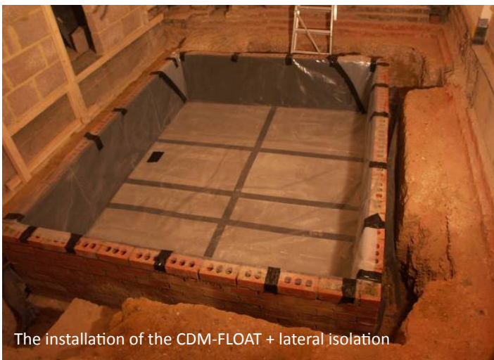
The installation of the CDM-FLOAT + lateral isolation