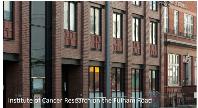
Institute of Cancer Research on the Fulham Road CR

• CDM-UK isolated the inertia bases using the CDM-MACHINE-FLOAT system. The completed installation allowed the operators to zoom into microscopic detail without interference from outside vibration sources.