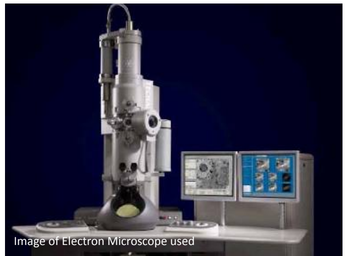
Image of Electron Microscope used