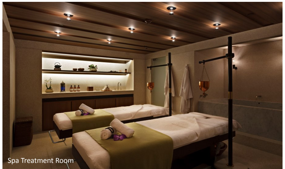
Spa Treatment Room