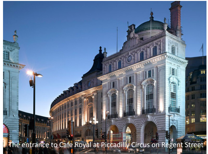
The entrance to Cafe Royal at Piccadilly Circus on Regent Street

• The resulting environment is quiet and tranquil allowing customers to be pampered for hours on end.