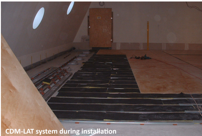
CDM-LAT system during installation