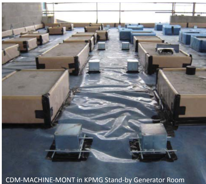
CDM-MACHINE-MONT in KPMG Stand-by Generator Room