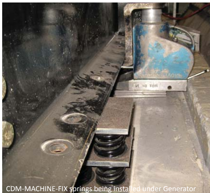
CDM-MACHINE-FIX springs being installed under Generator