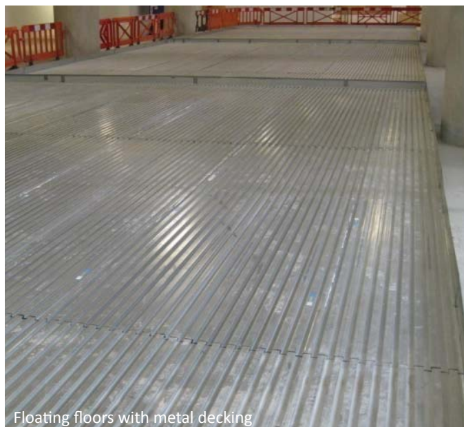
Floating floors with metal decking