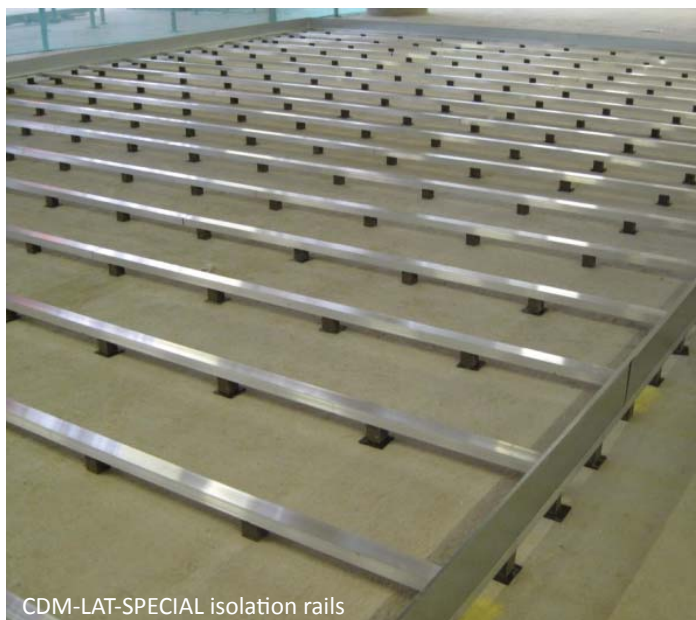
CDM-LAT-SPECIAL isolation rails