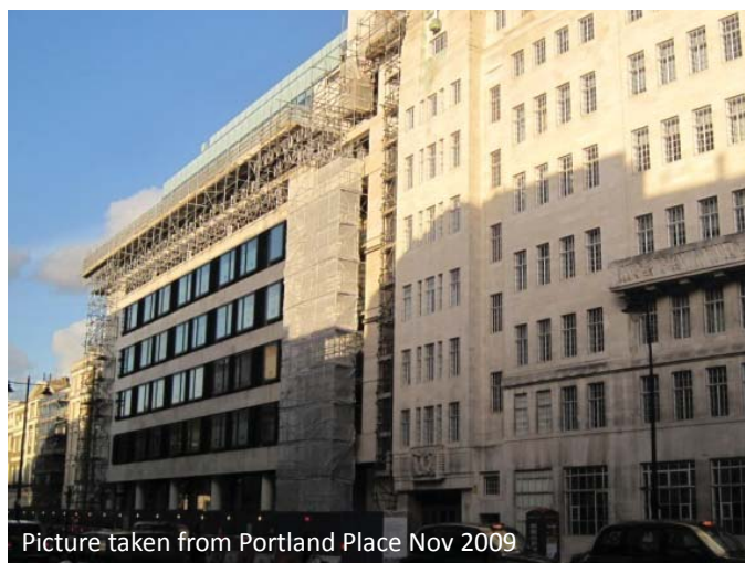
Picture taken from Portland Place Nov 2009

• On the ground floor the floors were 90mm concrete on 100mm void; the 2nd floor was 90mm concrete on 75mm void and the 3rd and 4th floors 90mm concrete on 50mm void.